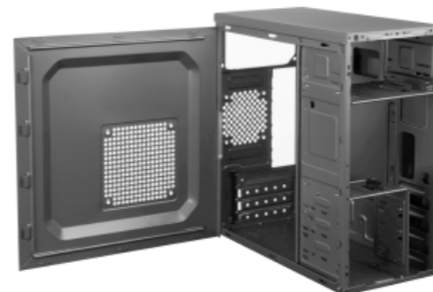
Case Bareness Dimension: 345*170*325mm (HxWxD)